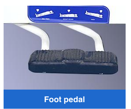
The foot pedals around the bed for easy access.

The guardrails around the bed can be easily raised or lowered by mechanical devices, also with locking function.