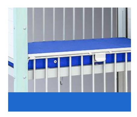
Soft mattress with water-proof cover, easy for clean.