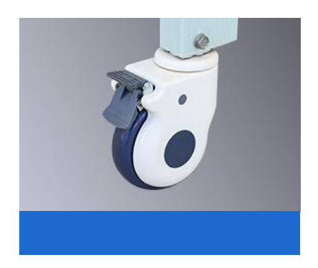
4 pcs dia 125mm castors, swivel type with locking.