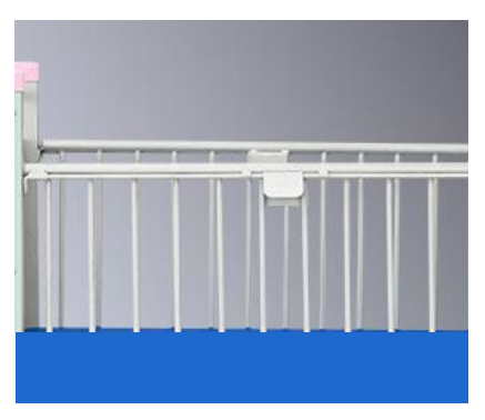
Safety full length side railing will protect patient well from falling down, easy for up-down.