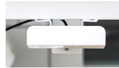
CPR Release the back-rest for emergency CPR.