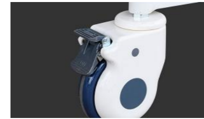
CASTOR Diameter of 125mm, Single castor with brake. (Option: castors with the central braking system)