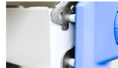
HEADBOARD & FOOTBOARD LOCKING KEY They can be easily fixed to the bed frame through this lock key and also easy to disassemble.