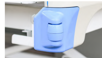
BUMP CASTOR Reduce the impact of the collision, safe and slinky.