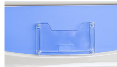
CASE FOLDER There is case card folder on the footboard to place patient information.