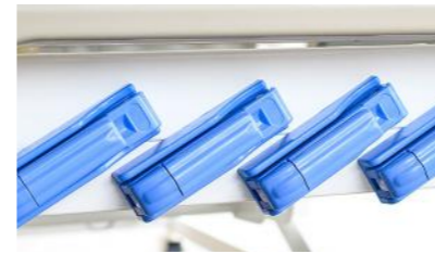
MANUAL CRANK For manually operating back, knee, Hi-Low Trendelenburg & Reverse-Trendelenburg functions.