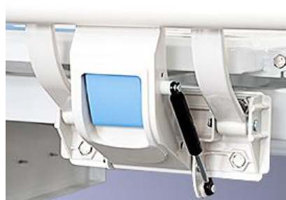
Side rail lock

There is an oxygen bottle holder at the bottom of the bed for easy use.