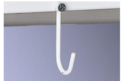
Urine bag hook

There are infusion holes on the four corners of the bed.