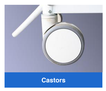
4 luxurious silent double-sided wheels with central brake system.