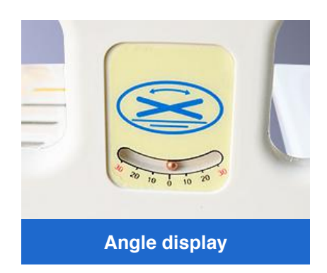
Angle display on the side rail,can indicate the adjustment angle of the bed.