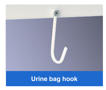
Urine bag hooks on both sides of the bed for easy use in any position.