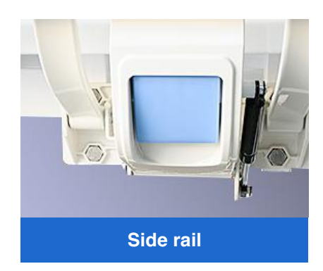
Four split side rails,tuck-away type,special protection mechanism can prevent patient to drop down the railing from inside bed.