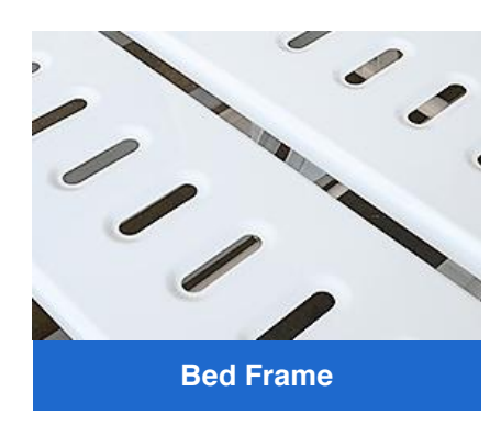
MS perforated platform with ventilation hole, antibacterial, corrosion resistant.