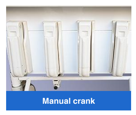
Four pieces of foldable manual crank at foot side of the bed.