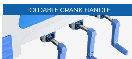
FOLDABLE CRANK HANDLE