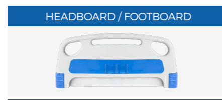
HEADBOARD / FOOTBOARD