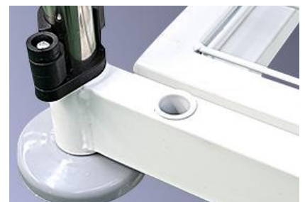
IV pole hole

stainless steel head/foot board with laminated panel gives an attractive appearance and easy to push the bed.