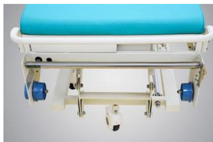
Sheet roll holder

There are control buttons at the end of the bed for the doctor's convenience.