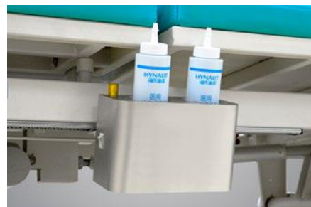
Ultrasonic coupling agent heater

With automatic correction function and automatic paper changing function of three lengths.