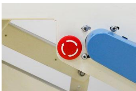
Emergency stop button

With heating function, can slide, easy to use.