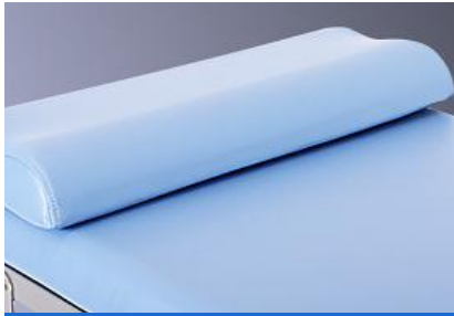
Pillow And Mattress

Ergonomically designed pillow for easy use, seamless high-density mattress, antibacterial, corrosion-resistant and scratch-proof, easy to clean.