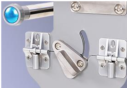
Quick bed sheet changing device

Sheet roll holder on both ends of the bed ,easy for automatically sheet change.