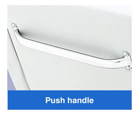
The back of the sofa is equipped with a push handle for easy pushing.