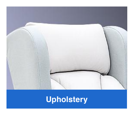
Luxurious cushions bring users more comfort.