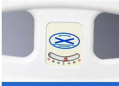
Degree indicator, easy for position indication.