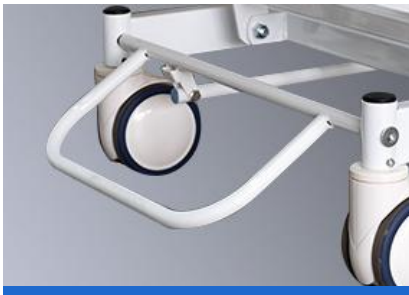
4 pcs dia 125mm castors, central locking.