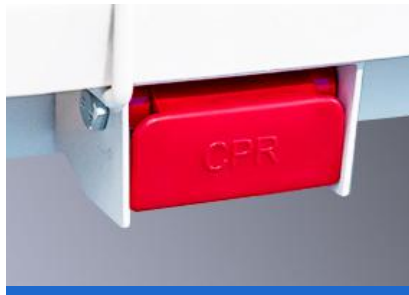
Manual CPR in each side of back board.