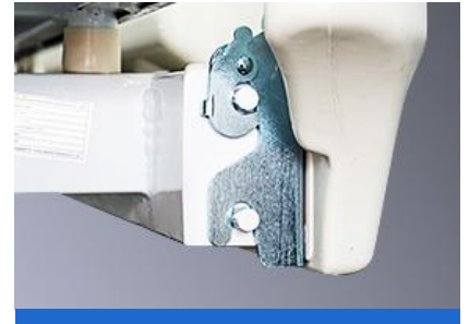
Detachable ABS head/foot board for emergency application.