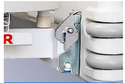
Detachable head/foot board

There are 4 bump cover in each corner, it will protect bed well.