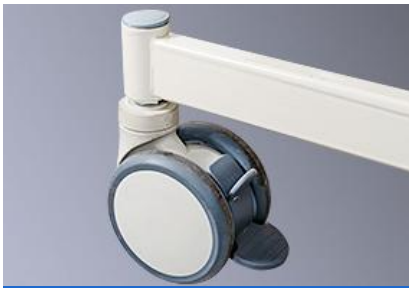
Wheels and locking

Aluminum alloy fold-able type side railing with 6 bars.