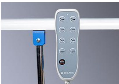
Remote hand control with electric CRP

Head/foot board can be removable easily and shortly due to the detachable design.