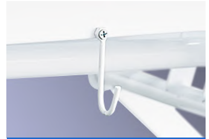
Urine bag hook

Removable crank can be inserted into any hole to control the back,foot section and height.