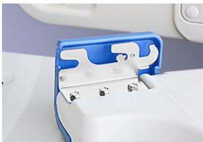
Removable head and footboard

MS perforated platform with ventilation hole,antibacterial, corrosion resistant.