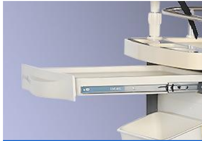
Extended working surface

ABS engineering plastic one-step molding countertop, with handles and stainless steel guardrail.