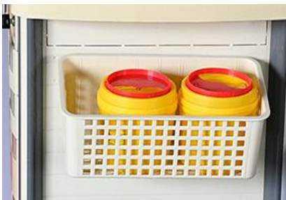
Basket with sharp boxes

Garbage cans with different colors facilitates garbage sorting